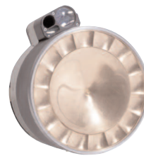
Skeet warheads' have two self-destruct modes & a timeout feature that solves the hazardous unexploded ordnance problem.