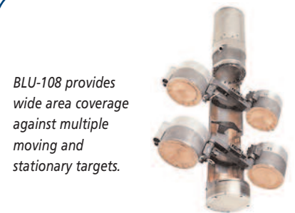
BLU-108 provides wide area coverage against multiple moving and stationary targets.