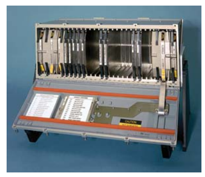
Internal view of chassis