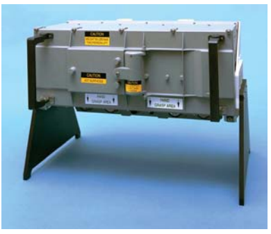
External view of chassis